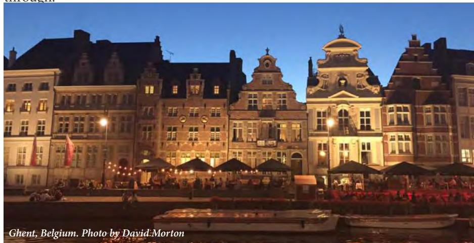
Ghent, Belgium.